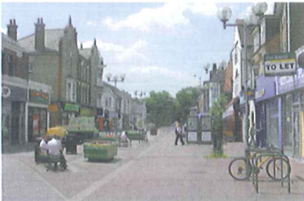
Horley High Street