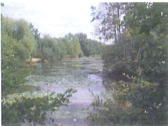
Horley Riverside Gate