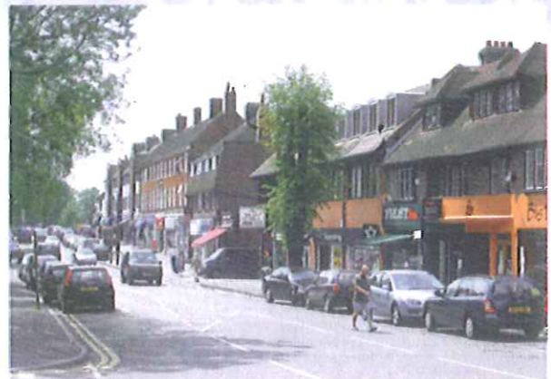
Banstead High Street