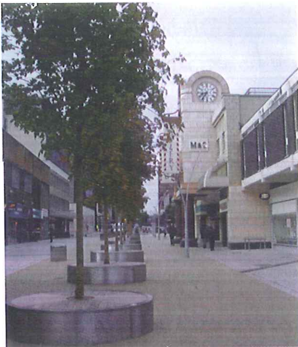
Redhill High Street

Priory Park which is undergoing a restoration project provides some 200 acres of open space and woodland. By contrast the Castle Grounds tucked behind the shops in the High Street provide a quiet retreat.