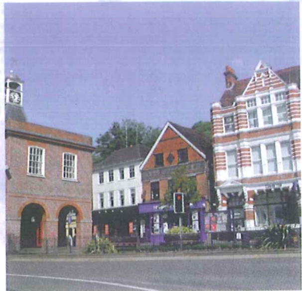
Reigate High Street